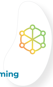
High performing teams