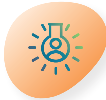
Lab to leadership™