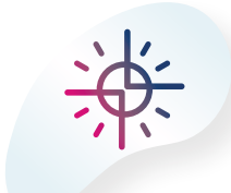
Leader as coach